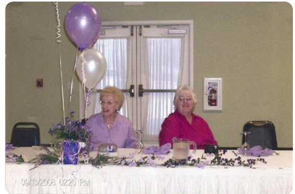
90th Birthday Bash