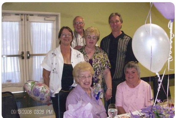
90th Birthday Bash