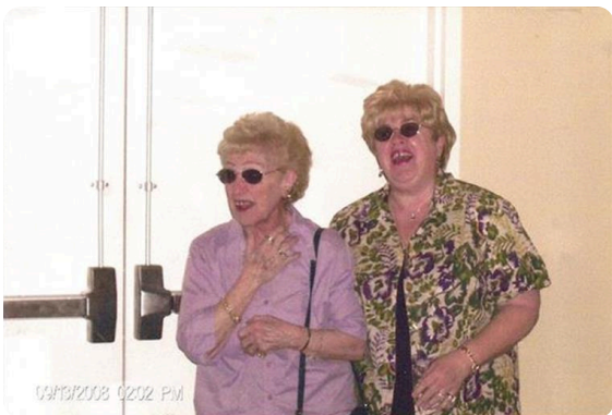
90th Birthday Bash