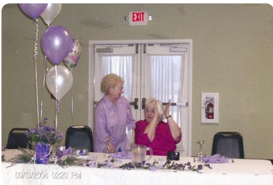
90th Birthday Bash