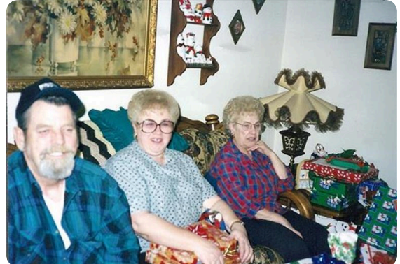
90th Birthday Bash