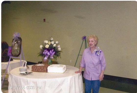
90th Birthday Bash