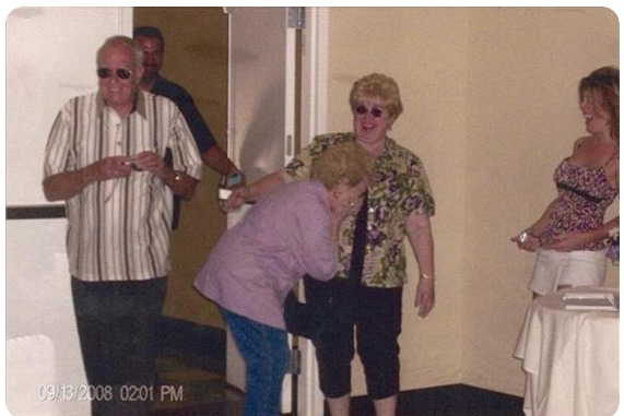
90th Birthday Bash