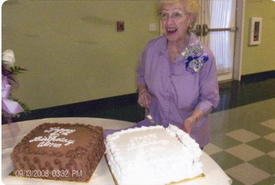
90th Birthday Bash